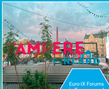
Euro-IX Forums in Tampere and Edinburgh 2022